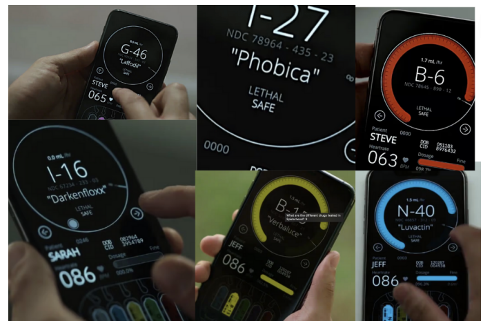
Grafico de estadísticas sobrevivientes ataque 9/11

antidepressants and opioids. In general, nearly a million individuals have died in the United States from drug overdoses since 2000. This is the next concern that will arise if this sort of medicine is used. What you want to know about these chemicals is how accurate they are with emotions and how they effect each and every individual and the environment. What you notice about these substances is how exactly they are with emotions and how they influence each and every individual, and the intake isn't unpleasant; in fact, these sorts of chemicals are simpler to administer and offer.